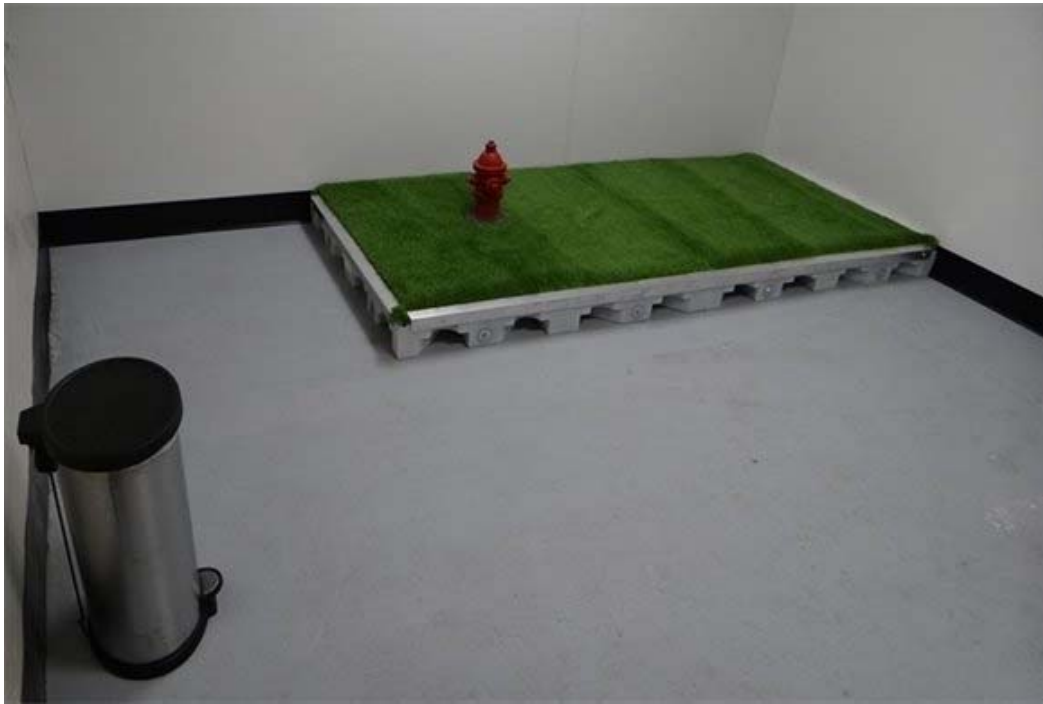
Post-Security Service Animal Relief Area