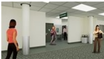
Unified Entry to Enhanced Restrooms.