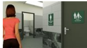
Closeup of Enhanced Restrooms.

The Restroom enhancements will include a convenient unified entrance, twice the number of fixtures, a change to a private room concept, and also include a new "family" Restroom.