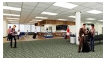
New Food and Beverage Concession

An additional upgrade for our customers includes a new Food and Beverage Concession on the B Concourse. The facility will feature a new open walk-up concept and include convenient customer seating near the boarding gates, a varied food menu, coffee, soft drinks, microbrews, domestic beers and wine.